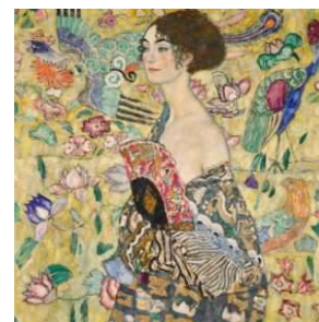
Dame mit Fächer by Gustav Klimt

But of course, with all the successes and surprises, this year wasn’t without its disappointments. Many sales didn’t do that well this year, with five in particular having more than half of their lots bought in. Two of these sales share the top spot at 59% unsold: the March 10th Modern Art Online sale at Bonhams New York, where 16 of the 27 lots went unsold; then, later at the 19th Century & Old Master Sale at Sotheby’s London July 6th, 71 of the 121 lots were bought in. Then there were the year’s most disappointing lots, those highly valued works that wound up getting bought in. Interestingly, the top three came from the same sale; the 20th Century Evening sale at Christie’s New York on May 11th, the number three sale of the year. They were Pull by Philip Guston (est $6 million to $8 million), The Moon and the Loop by Alexander Calder (est. $8 million to $12 million), and Femme assise au chapeau de paille by Pablo Picasso (est. $20 million to $30 million).