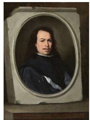
A portrait of Bartolomé Esteban Murillo