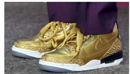
Air Jordan 3s

An anonymous donor left these remarkable kicks at the Portland Rescue Mission in the spring. While sorting through donations, a sharp-eyed individual in the Mission's long-term program discovered the rare gems and promptly informed the shelter staff.