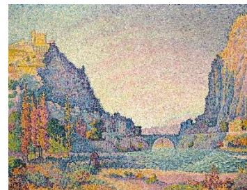
Sisteron by Paul Signac