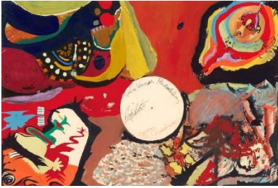
Images of a Woman by The Beatles

A painting created and signed by all four members of the Beatles will be up for sale at Christie's this February. In 1966, Beatlemania was at its height. The group had been touring nonstop for several years, traversing the globe from Britain to the United States to Japan. During their stay in Tokyo, they spent much of their time in the presidential suite at the Tokyo Hilton. Police advised that the Beatles stay at their hotel as much as possible since there were serious safety concerns due to some Japanese people's response to the band playing shows in the country. Between June 30th and July 2nd, the Beatles were scheduled to play five shows at Tokyo's famous Nippon Budokan stadium. Some were unhappy since the venue was exclusively used for martial arts events. Japanese nationalists, as well as supporters