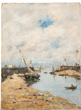
Trouville, le lougre échoué by Eugène Boudin