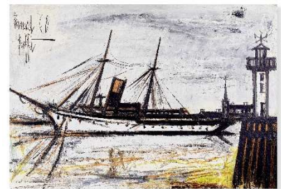
Yacht et phare by Bernard Buffet

However, they made a slight error that doomed the sale. The average minimum estimate for this sale was around €30K. Thirty of the fifty-one available lots had minimum estimates at €10K or below. While the number of unsold lots was a little high but nothing drastic, two in particular were expected to sell for hundreds of thousands of euros, yet were bought in and tanked the sale. The first of these two was a self-portrait by the Japanese-French painter Léonard Tsuguharu Foujita . Bonhams expected the 1928 oil-on-canvas painting of the artist and his cat to sell for at least €350K. Secondly, there was Le lézard aux plumes d'or by Joan Miró. Made from gouache, ink, and pencil on paper created on June 2, 1969, the work is very typical of the Catalan artist's use of bold lines and colors. It was expected to sell for at least €280K but also went unsold.