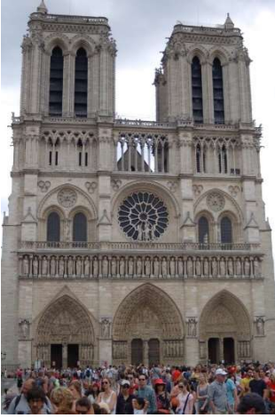
Notre-Dame Cathedral, Paris

Paris will host the Olympic games next summer, and the city's top spots, particularly its cultural institutions, are battenning down the hatches. The city already announced that the famous riverside booksellers, the bouquinistes , will be relocated for the opening ceremonies . And now, within a few days of each other, both the Louvre and Notre Dame made some big announcements.