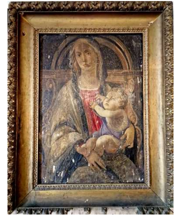
Madonna & Child (also called the Madonna delle Grazie ) by Sandro Botticelli

In 1982, Santa Maria delle Grazie sustained damage in an earthquake. The church moved some of its treasures out, entrusting them to local families. The Somma family received the Madonna delle Grazie . However, while the church was undergoing repairs, people seemed to have forgotten all about the Botticelli. However, some interest in the painting got kicked up again because the Carabinieri renewed its efforts to retrieve it earlier this year. The painting's transfer was peaceful, with Gragnano's mayor acting as an intermediary to ensure that the Somma family handed over the work. The Carabinieri, the force that amounts to Italy's cultural police, took possession of the painting, citing the requirement to guarantee the work's safety.