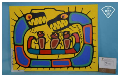
A forgery attributed to Norval Morrisseau

A Canadian court has sentenced the main perpetrator of one of the largest art fraud conspiracies. Back in March, I wrote about how police in Ontario had arrested a group of people for creating and selling thousands of artworks being passed off as originals by the Canadian indigenous artist Norval Morrisseau. Morrisseau is recognized today as one of Canada's greatest artists, putting indigenous art on the map. Even before he died in 2007, he was concerned about forgeries of his work on the market. This led him to create the Norval Morrisseau Heritage Society (NMHS) to manage his estate and provide authentication services.