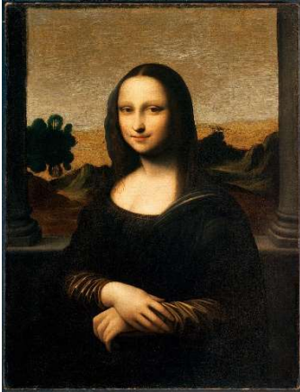
The Isleworth Mona Lisa

The Mona Lisa is one of the world's most iconic and enigmatic paintings. Art historians and amateur detectives have combed over the work, looking for answers to everything, from da Vinci's technique to the possible real location of the fantasy backdrop to the sitter's identity (which has since been confirmed). It's been the property of the French state for centuries, so the possibility of it being offered on the market is practically zero. But who knows its value now that a second Mona Lisa might be out and about?