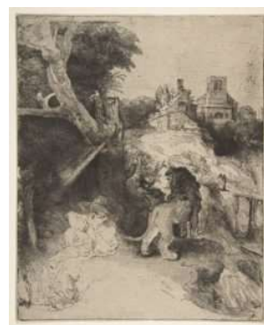
Saint Jerome reading in an Italian landscape by Rembrandt van Rijn

The very last lot in the sale was the 1650 print simply called The Shell . Made from etching, engraving, and drypoint, it is the only still-life etching Rembrandt ever created, making it one of the rarest works by the Dutch master. This particular shell is a conus marmoreus , or a marbled cone, only found in the Indian Ocean and parts of the Pacific. Shells like these were incredibly rare and typically kept in private collections belonging to wealthy individuals or nobility. Christie's predicted it would sell for no more than £120K. However, bid after bid prolonged the end of the sale, driving the price all the way up to nearly five times that amount at £580K / $730.1K (or £730.8K / $919.9K w/p). Shortly before The Shell came across the block, there was the print Woman Sitting Half Dressed Beside a Stove . Made in 1658 from etching, engraving, and drypoint, it is one of the four nudes and erotic scenes featured in the sale. It was last sold at auction at Christie's London in 1992 for £55K hammer. It is fascinating because it's less of a nude and more of a combination of styles. Yes, there is nudity, but the subject is not fully undressed. There are also elements of a simple interior or a genre painting. It is the largest nude print Rembrandt created in his series between 1658 and 1661. Woman Sitting Half Dressed Beside a Stove was only expected to sell for between £120K and £180K. It achieved more than double that at £400K / $503.5K (or £504K / $634.4K w/p).