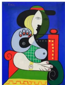
Femme à la montre by Pablo Picasso

2023 was another incredible year for the art market. In an interesting turn, Sotheby's took the top spot this year with $8 billion in sales, around the same as 2022. Christie's, however, saw a slight decrease, down from last year's $8.4 billion to about $6.2 billion. Also, Bonhams saw a record year with $1.4 billion, an approximate 14% increase from 2023 and a high in the company's history.