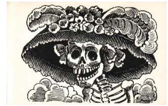
La Calavera Catrina by José Guadalupe Posada

Rivera was in Paris for much of the Revolution, honing his artistic talents. When the new revolutionary government started planning its mural campaigns, the Mexican ambassador to France reached out to Rivera and urged him to return home. Muralist painters like Rivera took inspiration from various sources to create their new work. They drew from centuries of indigenous wall paintings , the techniques of Renaissance frescos learned in Europe, and political caricatures from pre-revolutionary newspapers like those of José Guadalupe Posada. The old murals found at Mayan and Aztec archaeological sites were of particular influence to Rivera, borrowing their simplified figures and bold colors to express new ideas about nationalism and progress.