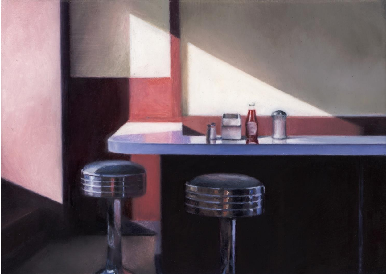
Leah Waichulis Through a Pane of Glass 5 x 7 inches Oil