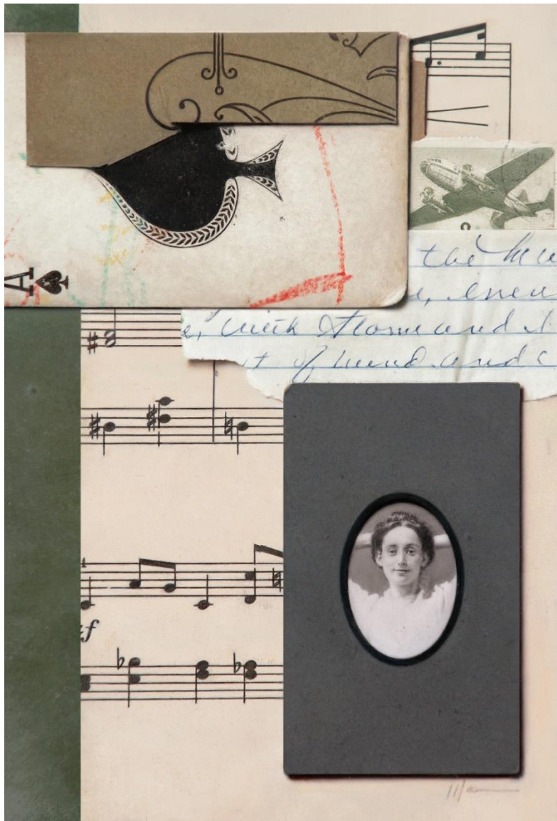
Anthony Waichulis George and Grace 7 x 5 inches Oil